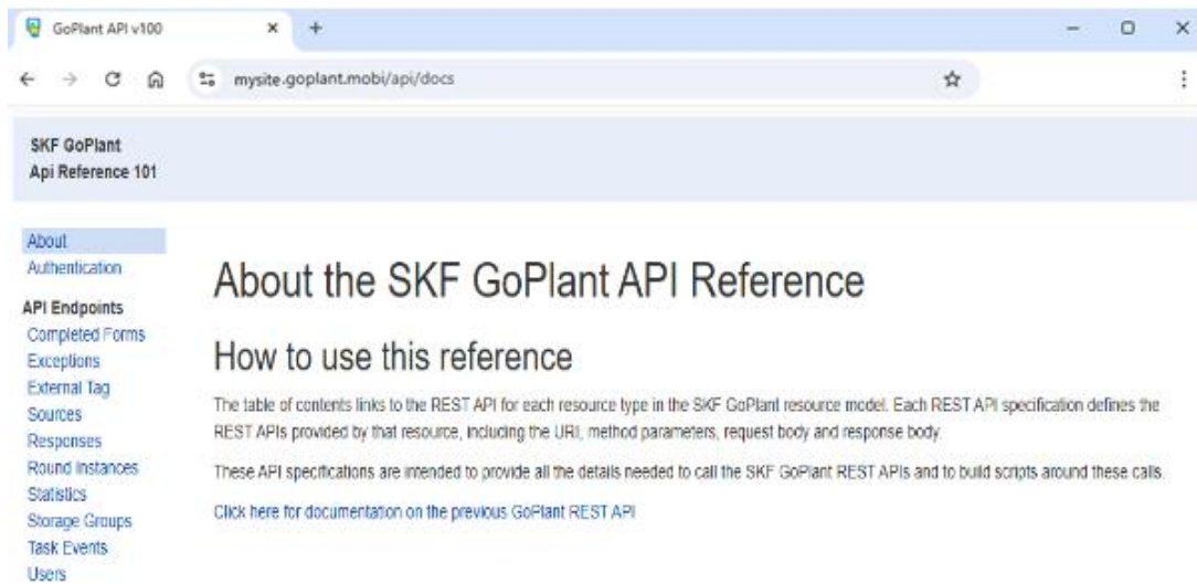
Figure 1: API Documentation Landing Page

Comprehensive documentation of the API is available online on your GoPlant instance. For instance, if your installation is https://mysite.goplant.mobi , your REST API documentation is available at https://mysite.goplant.mobi/api/docs